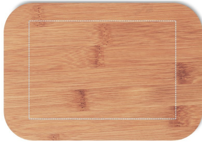
2. TOP SCREEN